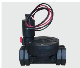
Solenoid shutoff valve

Our staff are both knowledgeable and helpful and understand that different situations require different setups. Feel free to call and discuss with our friendly staff about customising your toilet to meet your requirements.