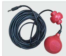
Float Lead for Waste Tank Alarm