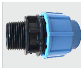
Hose Connector for Solenoid