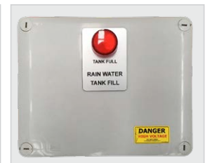
Waste Tank Alarm